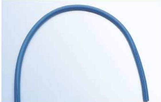
Reusable silicon temperature insulation tubing