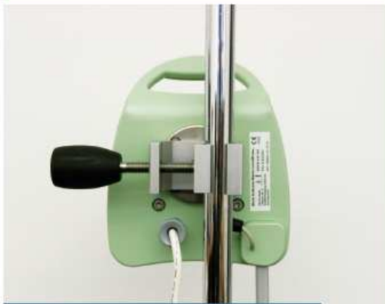
Nuova/05plus with heating sleeve connected